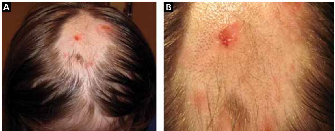
FIGURE 1. An irregular patch of alopecia (A) with small crusted areas. Close examination reveals broken hairs and areas of excoriation (B).

A 12-YEAR-OLD GIRL has a large, irregular area of hair loss over the central frontoparietal scalp. Physical examination reveals scattered short hairs of varying lengths and a few small crusts throughout the area of alopecia (FIGURE 1). The remainder of the scalp appears normal.