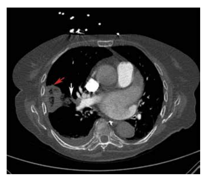
FIGURE 2. Computed tomography of the chest showed acute thromboembolism in the right interlobar artery (white arrow) and a wedge-shaped consolidation in the right-middle lobe (red arrow), consistent with pulmonary infarction.

At the time of admission, she had no fever, cough, orthopnea, or leg swelling. Her physical activity was restricted, with residual right-sided weakness after her stroke. Her heart rate was 125 bpm; her oxygen saturation level was 98% on 2 L of oxygen per minute via nasal cannula. She had an irregularly irregular rhythm, a jugular venous pressure of 7 cm H_2O , and no cardiac murmurs. Lung sounds were reduced at the bases, with faint crepitations.