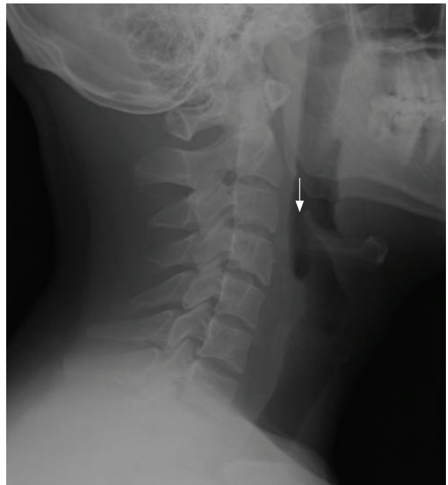
FIGURE 2. A lateral soft-tissue radiograph from a different patient shows a normal epiglottis (arrow).

A 55-YEAR-OLD MAN presents to the emergency department with a sore throat, odynophagia, hoarseness, and a high-pitched muffled voice for 1 day. He is otherwise healthy, with no fever, chills, or exposure to sick contacts.