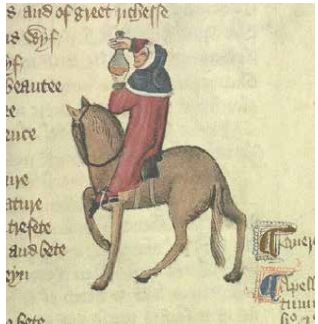
FIGURE 1. Urinalysis on horseback. From the Physician’s Tale in the Ellesmere manuscript of Geoffrey Chaucer’s Canterbury Tales , c. 1400.

Gilles de Corbeil in the 12th century wrote a poem on judging urine, intending it as an aid for remembering the supposed 20 different diagnostic colors of urine and describing in detail the use of the urine flask, a bladder-shaped container for studying the