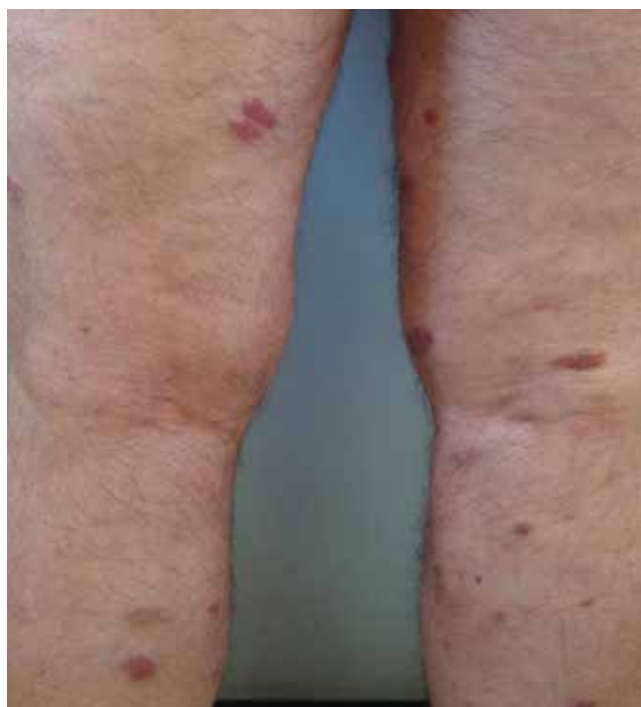
FIGURE 1. The poorly demarcated erythematous plaques had infiltrated the skin on the arms and legs.

A 70-YEAR-OLD MAN presented with multiple erythematous plaques on the arms and legs ( FIGURE 1 ). The plaques had infiltrated the skin and were poorly demarcated.