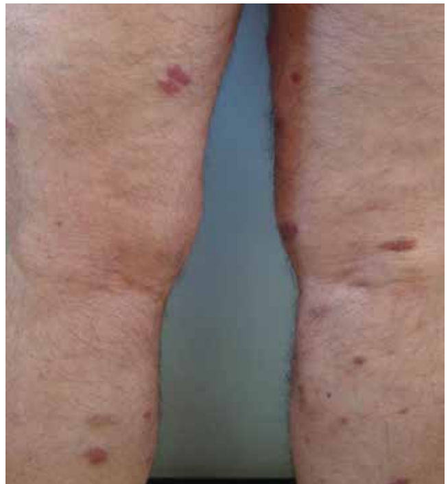
FIGURE 1. The poorly demarcated erythematous plaques had infiltrated the skin on the arms and legs.

A 70-YEAR-OLD MAN presented with multiple erythematous plaques on the arms and legs (FIGURE 1). The plaques had infiltrated the skin and were poorly demarcated.