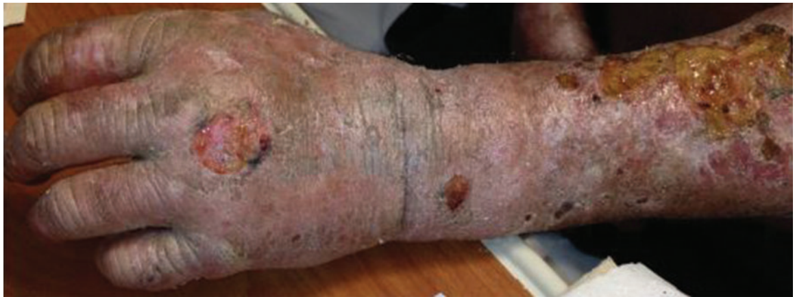
FIGURE 1. The skin of the left arm and hand is thickened and sclerotic. Atrophic scars are visible on the forearm, particularly on the dorsal aspect. There is patchy hair loss. Small bullae on the left forearm at the time of presentation had resolved by the time this photograph was taken.

He had burning pain in his arm for 2 to 3 days before he presented to the emergency room