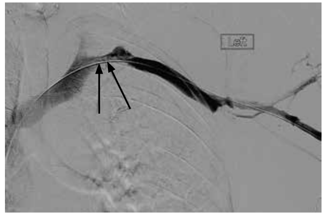
FIGURE 2. After 3 days of thrombolytic therapy, venography showed a 50% residual stenosis of the left subclavian vein.

A 43-YEAR-OLD MAN with no medical history presented with pain and swelling in his left arm for 2 weeks. He was a regular weight lifter, and his exercise routine included repetitive hyperextension and hyperabduction of his arms while lifting heavy weights.