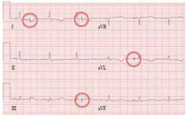
FIGURE 2. Electrocardiography 6 weeks after the device was placed showed normal sinus rhythm, but with inappropriate device discharges (circles).

Electrocardiography at the time of presentation showed a normal sinus rhythm with inappropriate ICD discharges (FIGURE 2). This finding prompted chest radiography, which showed that the ICD had rotated 90 degrees from its original position, and that the lead had completely wrapped around the generator and thus was no longer correctly positioned (FIGURE 3). The patient admitted to frequently rubbing (ie, twiddling) the area, which led to twisting and dislocation of the device, a complication known as twiddler syndrome.