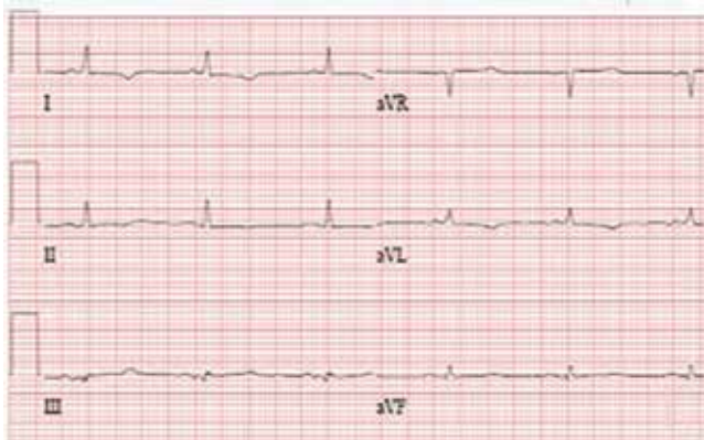
FIGURE 4. After reimplantation of the cardioverter-defibrillator, the electrocardiogram was normal.