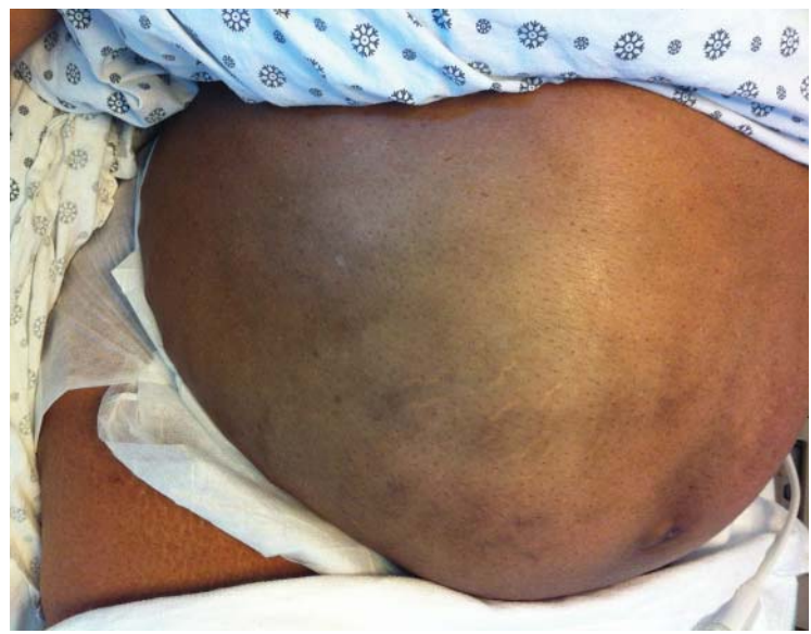
FIGURE 1. Ecchymosis of the abdominal wall, predominantly of the right flank (Grey Turner sign).