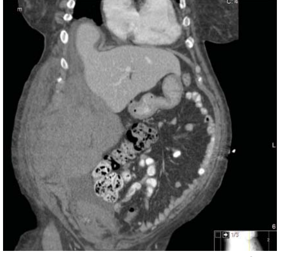
In most cases, rectus sheath hematoma resolves within 1 to 3 months