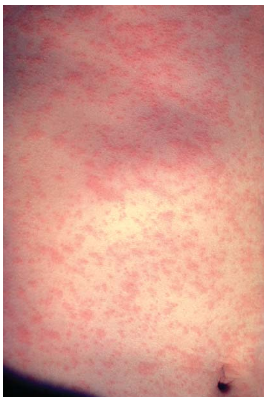
FIGURE 2. Measles on the 3rd day of rash.

FROM THE US CENTERS FOR DISEASE CONTROL AND PREVENTION.