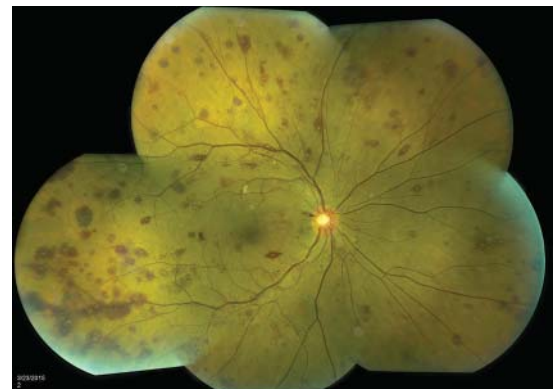
FIGURE 4. Wide view of multiple Roth spots.

episodes of epistaxis. Vital signs were within normal limits except for a heart rate of 110 beats per minute. Physical examination revealed pale conjunctivae and bilateral white-centered retinal hemorrhages and microaneurysms (Figures 1–4).