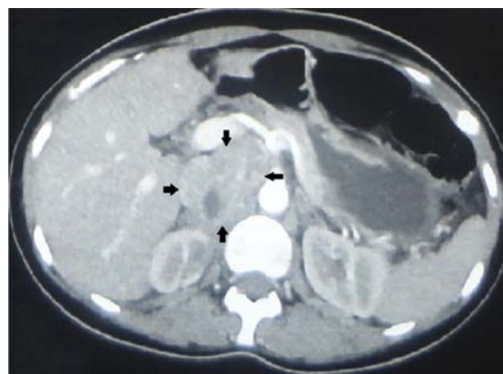
FIGURE 3. Computed tomography of the abdomen with contrast showed a heterogeneously enhancing lesion (arrows) in the right suprarenal area that measured 6.5 \times 5.5 \times 3.5 cm and displaced the inferior vena cava anteriorly.

genetic background, cutaneous lichen amyloidosis is also associated with familial medullary thyroid carcinoma, another rare variant of MEN type 2A. 4