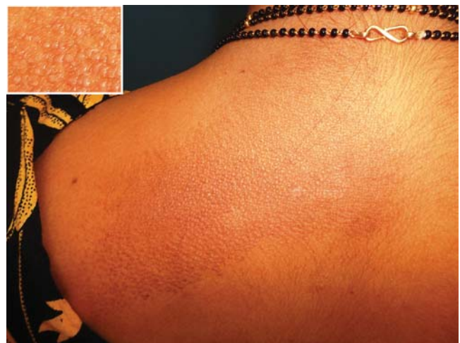
FIGURE 1. As seen in the inset, the skin-colored to hyperpigmented plane-topped papules coalesced to form a plaque over the left scapular area.

Our patient's scapular lesions and first-degree family history of MEN type 2A confirmed the diagnosis of the newly recognized variant, MEN type 2A-related cuta-