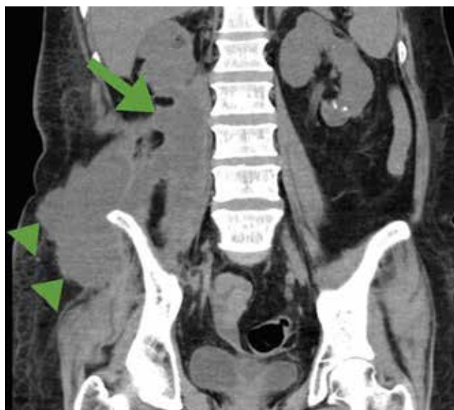
FIGURE 2. Computed tomography (coronal section) showed a low-density area 16 × 4 cm in the right psoas muscle (arrow), and a low-density area 11 × 7 cm in subcutaneous tissue connected to the psoas muscle (arrowheads).