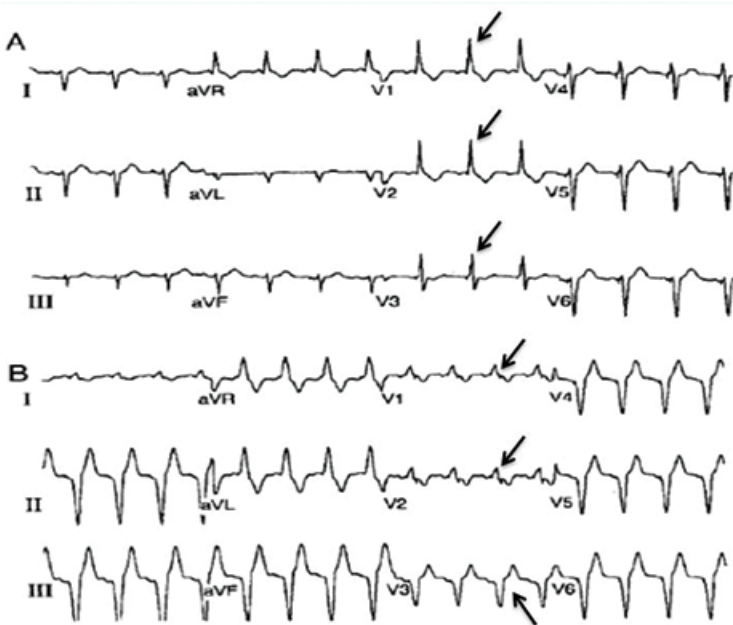
Figure 2. (A) Electrocardiogram from a patient with known left ventricular lead position through a patent foramen ovale. Arrows point to dominant R waves in leads V_1 , V_2 , and V_3 , compatible with left ventricular pacing. (B) The same patient after revision and placement in the right ventricle. Arrows point to dominant R waves in leads V_1 and V_2 , with a precordial transition to a dominant S wave occurring at lead V_3 .

Reprinted from reference 6 and reference 14 with permission.