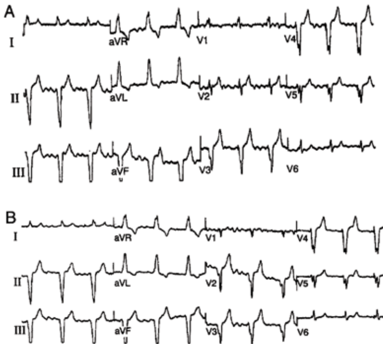
Figure 1. Typical 12-lead electrocardiogram showing right bundle branch block morphology from the right ventricular apex with (A) standard V_1 and V_2 lead positions and (B) return to left bundle branch block morphology after V_1 and V_2 are moved 1 interspace lower than standard.

Reprinted from reference 6 with permission.