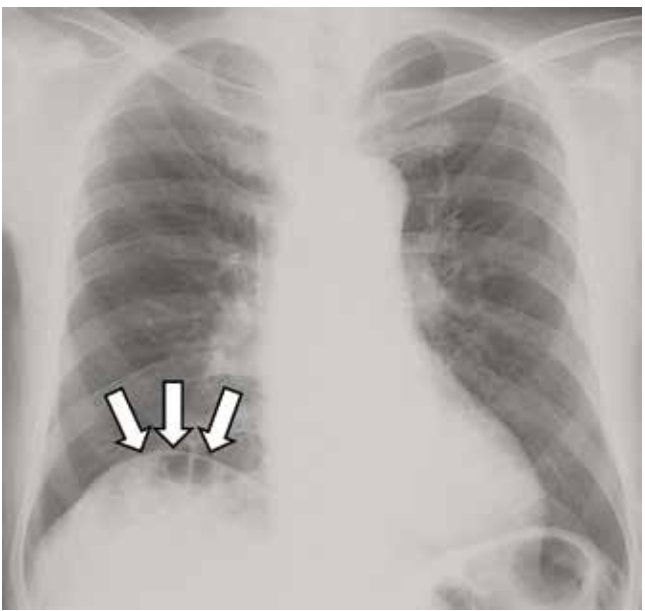
Figure 1. Radiography of the chest with the patient standing showed gas under the right diaphragm (arrows).