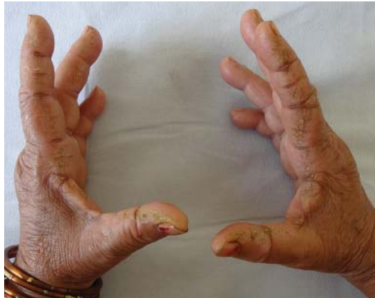
Figure 1. Both hands had symmetrical, linear, hyperkeratotic, fissured, scaly plaques on the radial aspect of the index fingers and ulnar aspect of thumbs, including the web area. Fissures were hyperpigmented. The palmar aspect of the fingers was not affected. The radial aspect of the middle fingers was minimally involved.

This sign is seen in about 30% of patients with antisynthetase syndrome