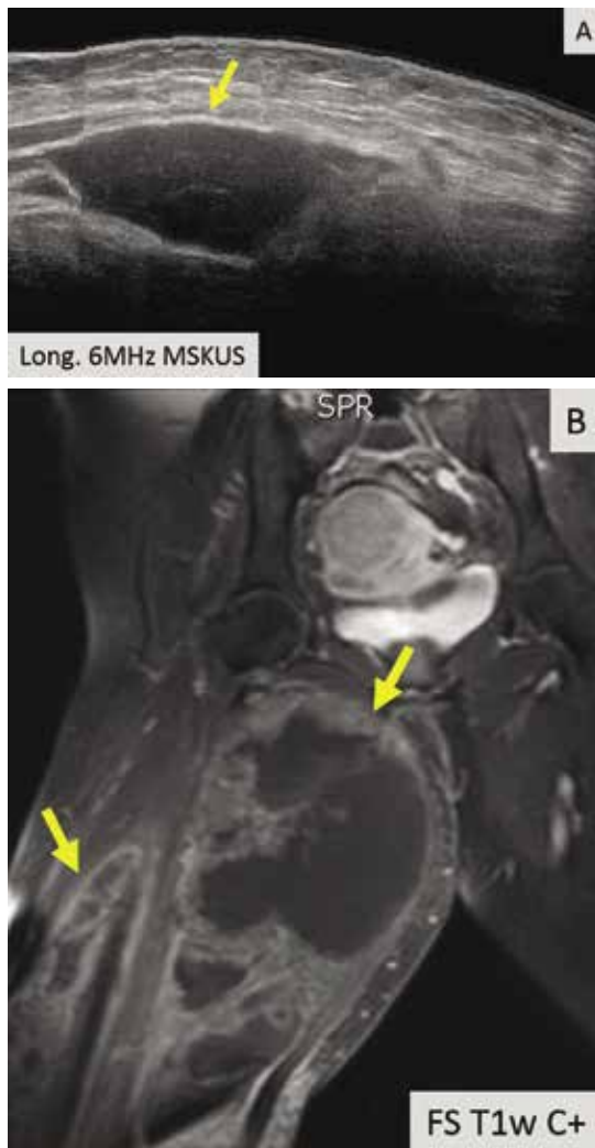
Figure 4. Musculoskeletal ultrasonography is inappropriate for evaluating large areas. Here, ultrasonography did not fully demonstrate the extent or nature of the abnormality within the adductor musculature of the patient’s thigh ( A , arrow). MRI demonstrated multiple large enhancing metastatic intramuscular masses ( B , arrows).

the probe images only a thin section of tissue (about the thickness of a credit card), referencing adjacent structures for orientation is more difficult with ultrasonography than with CT or MRI.