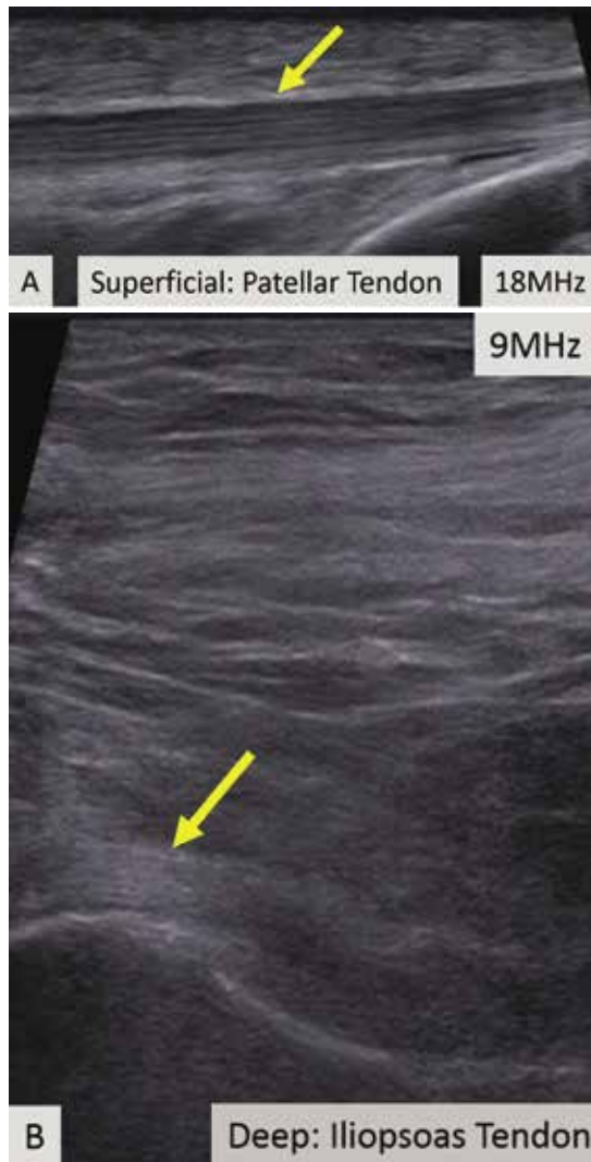
Figure 1. In ultrasonography, a trade-off exists between image resolution and penetration depth. The superficial patellar tendon ( A , arrow) can be seen with high resolution, demonstrating its fine internal structure. The much deeper iliopsoas tendon cannot be seen with the same high resolution because of its deep location ( B , arrow).

Musculoskeletal ultrasonography is having a resurgence