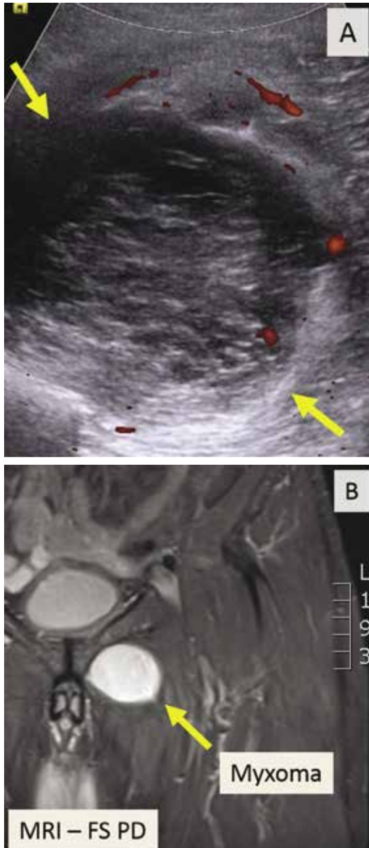
Figure 5. A deep, complex intramuscular soft-tissue mass seen on ultrasonography (A, arrows) required further evaluation with MRI (B, arrow), which better demonstrated the mass's margins and its relationship to surrounding structures.