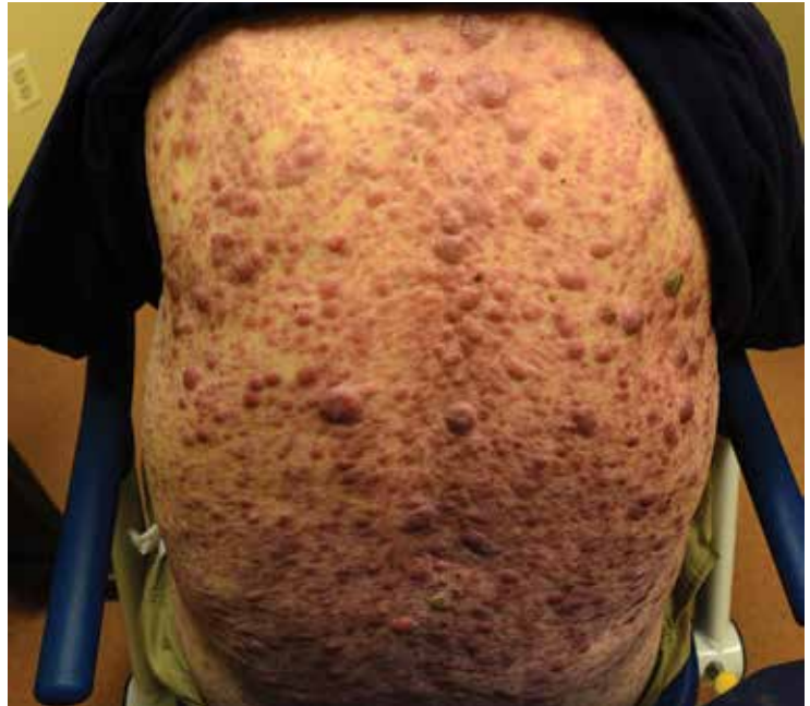
Figure 1. The firm, indurated nodules ranged in size from 1 to 4 cm.

and anaplastic large-cell lymphoma. CD2 and CD3 are typically expressed in mycosis fungoides, but these were not expressed. The tumor cells did not express myeloperoxidase, a myeloid marker.