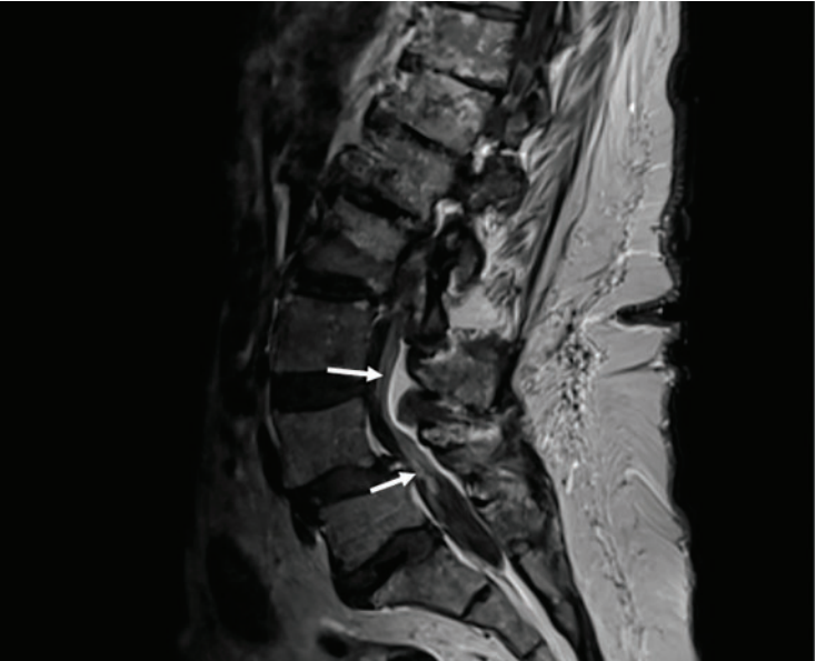
Figure 1. Magnetic resonance imaging of the lumbar spine with contrast showed cauda equina enhancement at level L5 to S1 (arrows) in axial T1 sequence (top) and sagittal T1 sequence (bottom).

3 Given the presence of serum IgM monoclonal gammopathy in this patient, which is the most likely diagnosis?