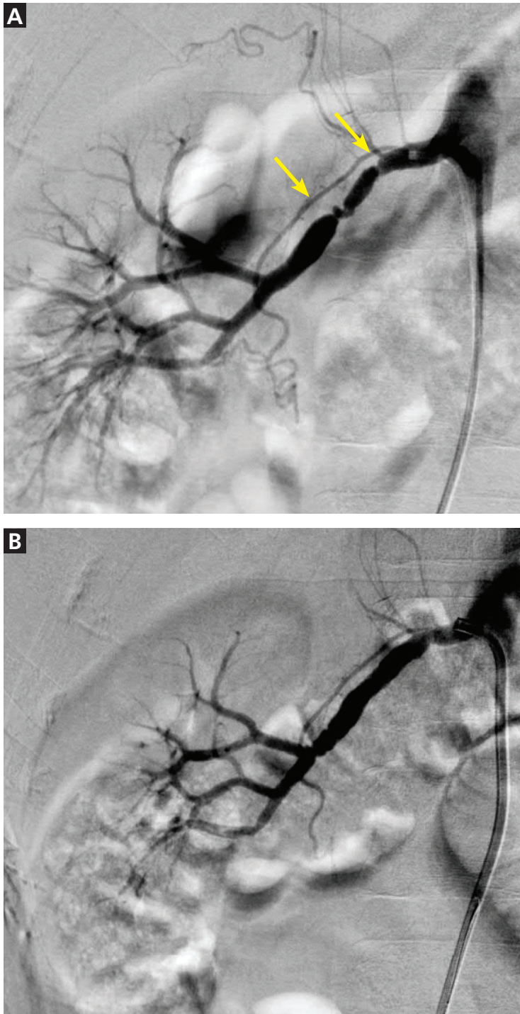
Figure 2. The right renal artery (arrows) before (A) and after (B) percutaneous transluminal angioplasty.

At follow-up 2 years later, his blood pressure was normal without medication; peak systolic velocity of the right renal artery was 203 cm/second.