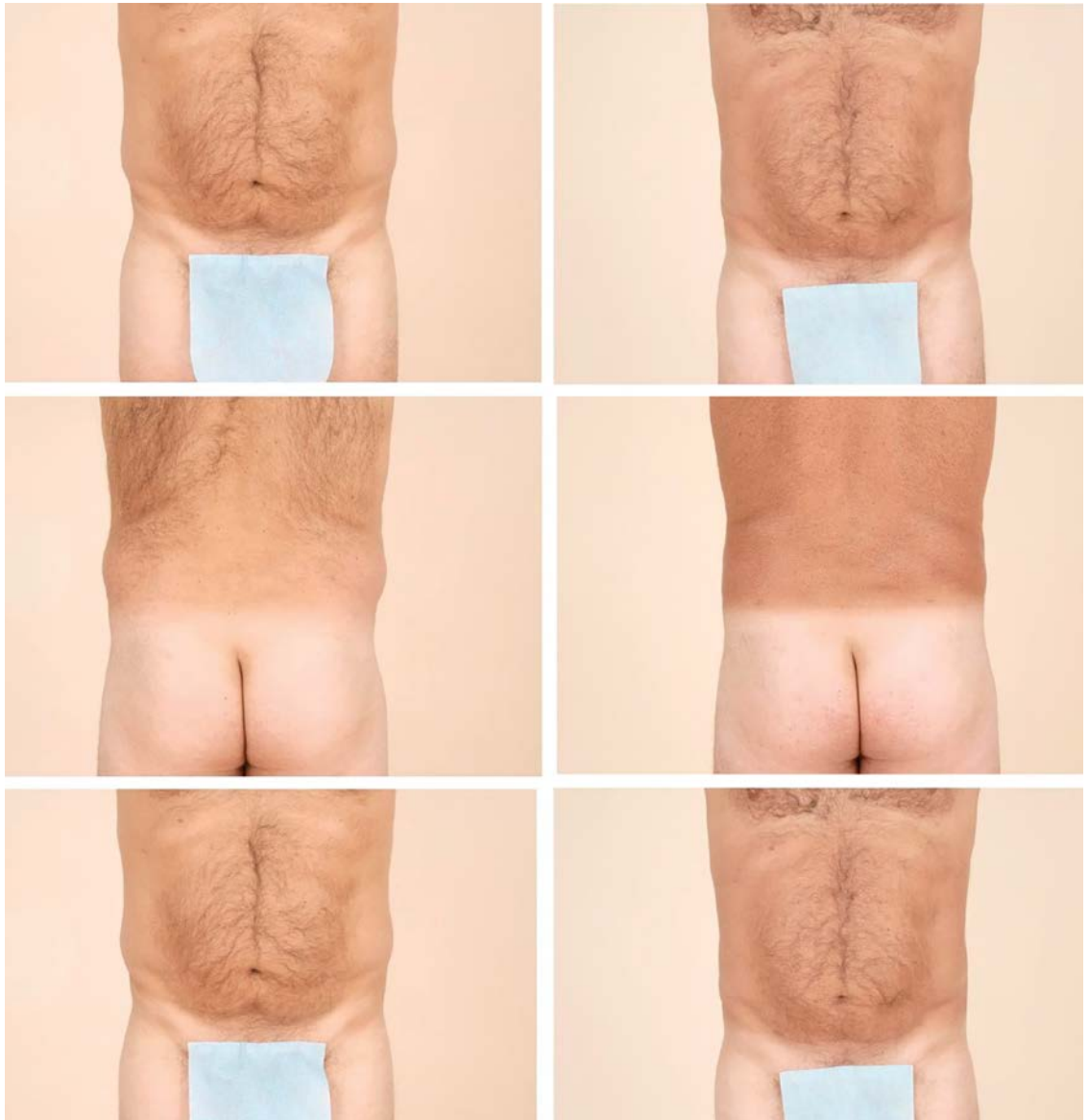
Figure 1. Left: Preoperative appearance of a 52-year-old man who presented for liposuction of localized adiposity within the abdomen and bilateral flanks. Right: The same patient 6 months later after removal of 1.4 L of adipose tissue.

Ideally, patients have adequate skin elasticity and are within 20% to 30% of their ideal body weight