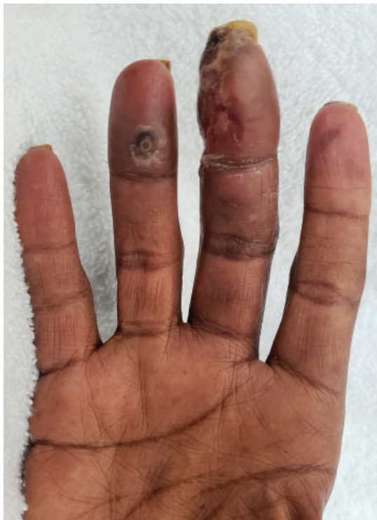
Figure 1. Physical examination revealed purplish discoloration and ulceration of the third and fourth fingertips.

A man with chronic kidney disease presents with pain and ulceration of the fingers