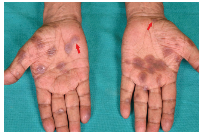
Figure 1. Well-defined dusky, discoid patches and plaques with peripheral collarette of scales (red arrows) on the palms.