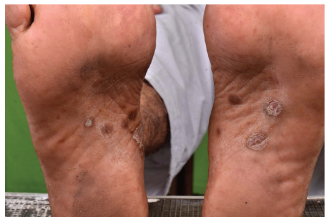
Figure 2. Well-defined dusky, discoid plaques with peripheral desquamative scaling on the instep of the patient's soles. Some of the lesions appear psoriasiform.

A 51-YEAR-OLD MAN presented with a 3-month history of reddish-brown lesions on his body and scaly brown lesions on the palms and soles and a 1-month history of mildly painful oral erosions. He had also noticed a buzzing sound in the right ear for the past 20 days.