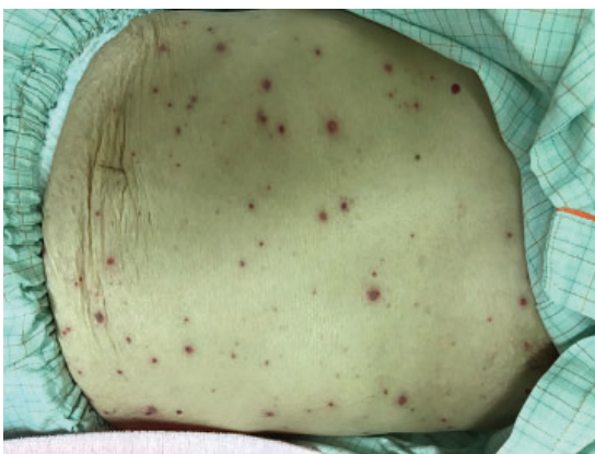
Figure 1. Hemorrhagic vesicles with red haloes of various sizes distributed over the whole body.