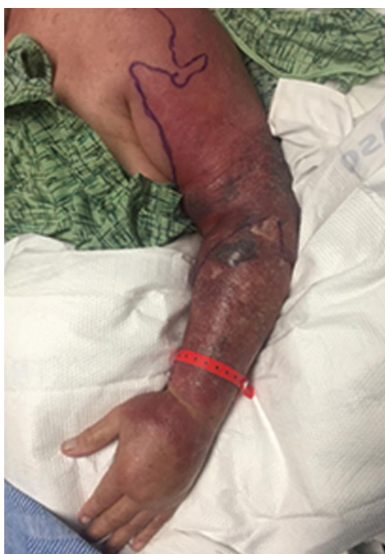
Figure 1. Erythema and swelling of the left upper extremity at presentation.

The patient had no history of allergies to medications or of adverse reactions to vaccinations previously