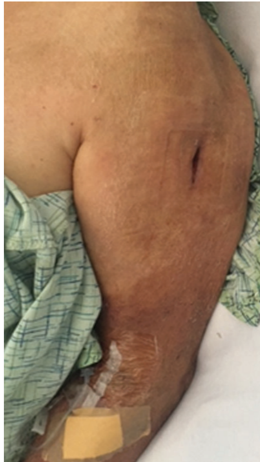
Figure 3. Improvement of the swelling and erythema on hospital day 7.

The mRNA COVID-19 vaccine is a lipid nanoparticle-encapsulated, nucleoside-modified mRNA vaccine that encodes the prefusion spike glycoprotein of the SARS-CoV-2 virus responsible for COVID-19. 1 Local reactions include mild to moderate pain at the injection site, and systemic side effects like fatigue, headache, and fever have been common after the second dose. 2 Immediate reactions