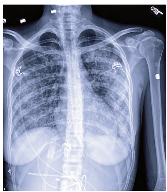
Figure 1. Chest radiograph showing widespread, patchy airspace opacification.

A 19-YEAR-OLD WOMAN with a history of mild intermittent asthma and regular tetrahydrocannabinol (THC) consumption by "vaping" and "dabbing" (inhaling vaporized, highly concentrated THC oil) presented with several days of fevers, dyspnea, and productive cough. She was febrile, tachycardic, and tachypneic. Laboratory testing revealed an elevated white blood cell count of 15.0 × 10°/L (reference range 4.4–10.0 × 10°/L) and a procalcitonin level of 0.3 ng/mL (reference range 0.1–0.5 ng/mL). Her initial chest radiograph was unremarkable.