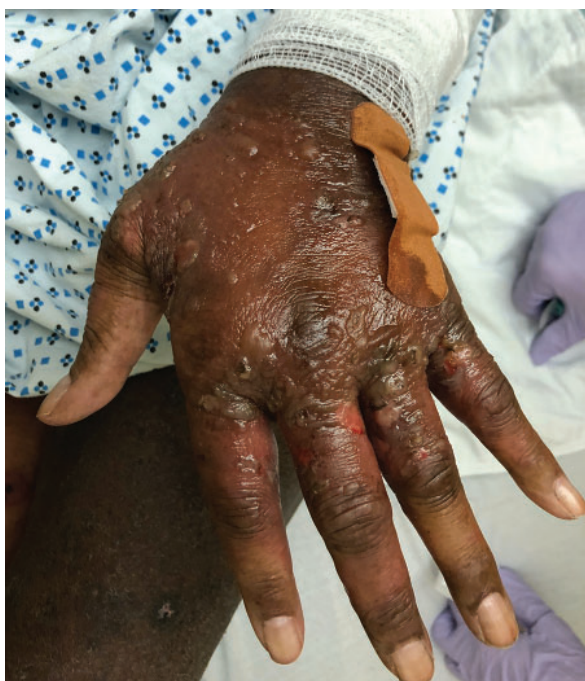
Figure 1. The dorsum of the left hand with tense bullae and erosions.