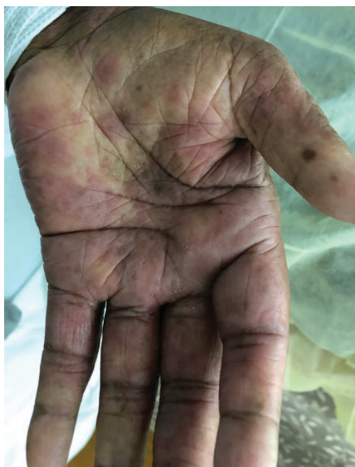
Figure 2. The left palm with red, atypical target lesions.

A woman with psoriasis, chronic edema, and hypertension presented with a progressive, painful blistering rash