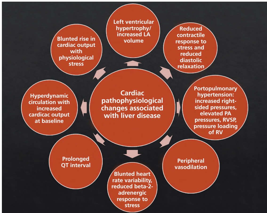
Figure 1. Cardiovascular pathology in end-stage liver disease.

LA = left atrial; PA = pulmonary artery; RV = right ventricle; RVSP = right ventricular systolic pressure