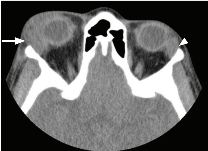
Figure 2. Axial computed tomography of the orbits showed homogeneously confluent, enlarged lacrimal glands, right (arrow) greater than left (arrowhead).

tion were felt to be less likely, sarcoidosis was favored as the cause of the patient's lacrimal enlargement. Given the absence of systemic symptoms and normal results on chest computed tomography, disease involvement was initially considered to be isolated to extraocular tissue, and the patient was diagnosed with extraocular sarcoidosis using International Workshop on Ocular Sarcoidosis criteria. 2