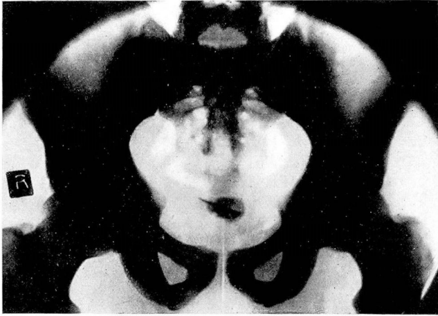
Fig. 1. Vesical calculus from incrustated pin.