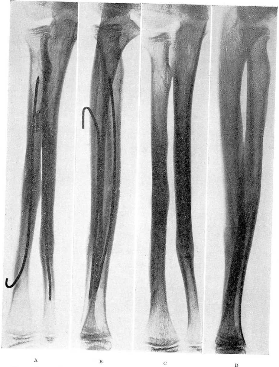
FIG. 2. Case 1. (a and b) Excellent callus formation at the end of eight weeks. (c and d) Result at end of twelve weeks after removal of wires.

under anesthesia. The position that was obtained is shown in figure 1. The arm was very swollen, and any further attempt at manipulation seemed contraindicated.