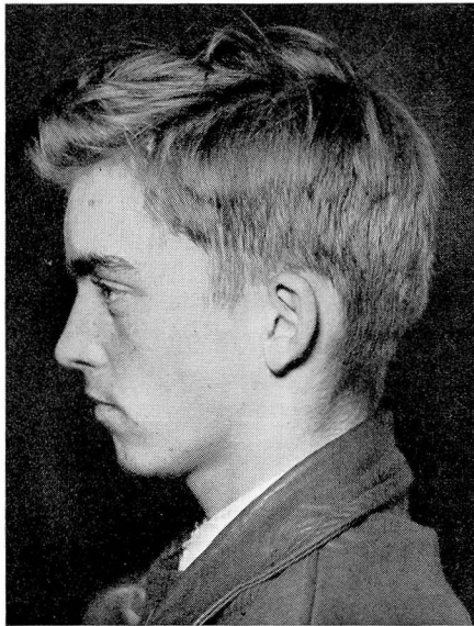
FIG. 5. Case 4. Cosmetic result five and one half months postoperative.

Comment: This is the most significant case in this series. Osteomyelitis of the frontal bone secondary to sinusitis carries a very high morbidity when treated by the usual method of removing the infected bone and leaving the scalp widely open. The result in this case was so gratifying that this method certainly deserves further trial. Even in case continuation of the infection should necessitate subsequent removal of the implant the patient will have lost nothing. The presence of the implant controls the abnormal pulsation of the uncovered brain and this splinting of the wound aids its healing.