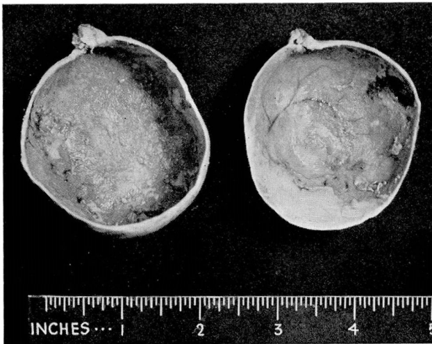
FIG. 2. Case 3. The abscess capsule after fixation.

Pus culture revealed Streptococcus salivarius . For ten days the patient was given intramuscularly 15,000 units of penicillin every three hours, and oral sulfadiazine 1 Gm. four times daily. The first three days the scalp over the implant was tapped daily, a small amount of bloody fluid removed, and 15,000 units of penicillin instilled beneath the scalp. Thereafter no fluid collected, temperature was normal, convalescence was uneventful, and the patient was discharged from the hospital March 4 (fig. 3). Patient was readmitted to the hospital March 12 with a temperature of 102 F. and symptoms of meningitis. Spinal fluid pressure was over 700 mm. of water; fluid contained 800 polymorphonuclear cells; culture was sterile. Patient was treated with daily spinal puncture, intrathecal and intramuscular penicillin and sulfadiazine. He improved for a time but on March 24 became irrational. A needle, introduced through the scalp and through one of the tantalum plate perforations into the right frontal lobe, encountered a large abscess beneath the cortex. Seventy-five cubic centimeters of thick pus was aspirated; culture again revealed Streptococcus salivarius .