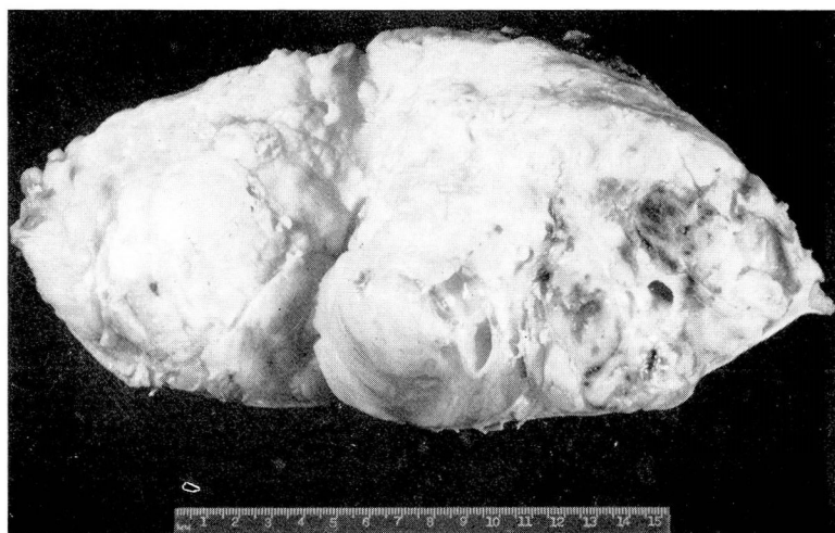
FIG. 2. Sectioned surfaces of gross specimen showing lobulated large tumor mass with bulging surfaces, partly smooth, homogeneous, and in part cystic. Neoplasm comprises major portion of specimen.

of the cone the skin was thinned, erythematous and glistening, and the surface nodular; these protuberances measured 5.0 x 3.0 cm. for the largest and 2.0 cm. for the smallest. Near the apex of the specimen the skin was ulcerated in several places and through these areas bulged red and pink friable tissue. The nipple was present near one of these ulcerated zones. Palpation of the external surface gave the impression of multiple nodules of firm tissue within the breast substance and not attached to the skin. On section, the specimen was found to be composed almost entirely of a coarsely lobulated fleshy tumor mass having irregular areas variably firm, soft, hemorrhagic and of necrotic appearance. There were numerous cystic structures present, containing opaque, gray-white material and averaging 1 cm. in diameter. The mass was demarcated from surrounding breast and fatty tissue, but there was no capsule. Muscle tags and fascia separated it from the deep line of excision.