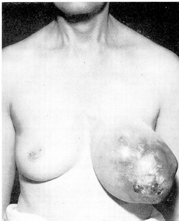
FIG. 1. Greatly enlarged left breast with marked skin changes including ulceration.

Gross Examination: (Fig. 2) The specimen consisted of a cone-shaped breast 11.0 cm. across the base and 12.0 cm. in height, weighing approximately 800 Gm. There was normal appearing skin around the base, but at the apex