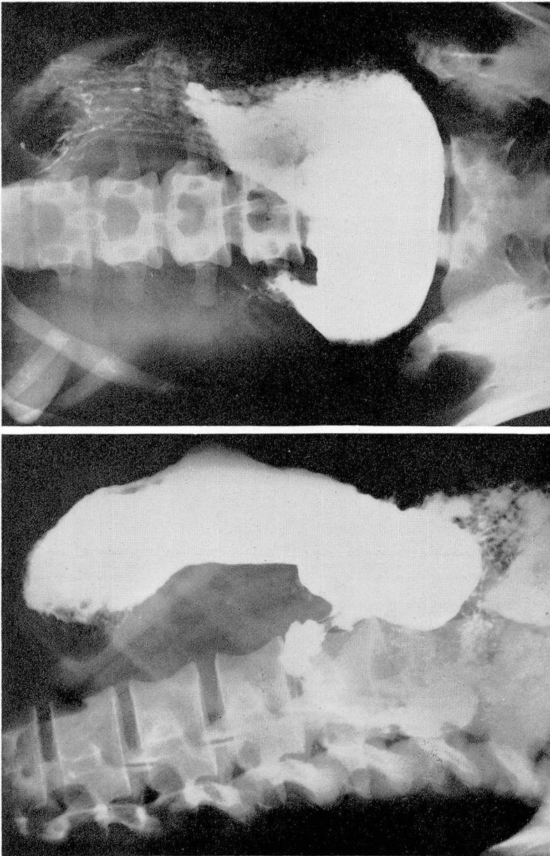
Fig. 2. (Case 2) Marked duodenal deformity. Duodenal bulb never filled out well. No ulcer crater demonstrated. Eighty per cent gastric retention in three hours.