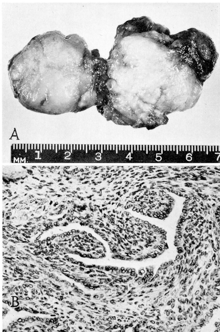
Fig. 2. Case 2. (A) Cut surface of bilobate gross specimen surgically removed. (B) Histology of neoplasm. The spindle-celled component is more loosely arranged in this area. Hematoxylin-eosin—methylene blue; X270.