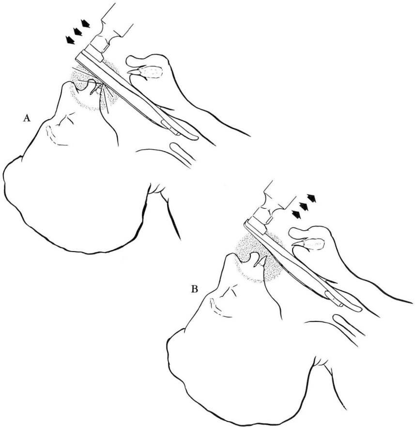
Fig. 3. Sketches showing techniques using A, the regular Wis-Foregger laryngoscope blade, and B, the modified blade.

The clinical advantages of the modified blade are apparent. For visualization of the larynx, the blade requires an upward and forward lifting force; therefore, the handle of the laryngoscope does not become a lever nor do the teeth act as the fulcrum for the blade in exposing the larynx. Should the blade be permitted to rest on the teeth, visualization immediately becomes impossible ( Fig. 3 ).