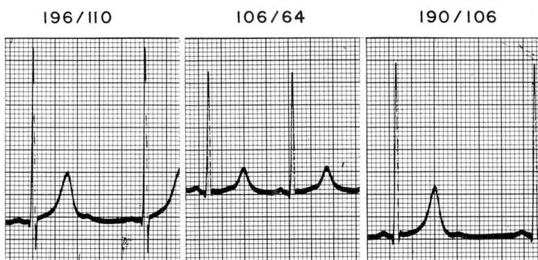
Fig. 1. Electrocardiograms ( V_5 ) showing decreases in voltage of the R wave during normotensive period (after administration of sodium nitroprusside), and increases in voltage after hypertension returns, following termination of sodium nitroprusside administration.

Changes in the voltages of S waves in V_1 or V_2 were not consistent. In one half of the patients an increase occurred, ranging from 1 to 6 mm., the mean increase being 11 per cent of the control values. In the other half the voltages were reduced from 1 to 8 mm., the mean reduction being 13.9 per cent of the control values. The sums of R waves in V_5 and S waves in V_1 were reduced in