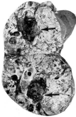
Fig. 3. Section of the neoplastic mass with an endothelial-lined cavity in the center (arrows) representing the arteriovenous fistula, and partly filled with tumor and organized blood clot.

typical of a renal tumor. The preoperative blood pressures showed a wide range of pulse pressures, from 94 to 115 mm. of Hg with variable diastolic pressures from normal to slightly elevated.