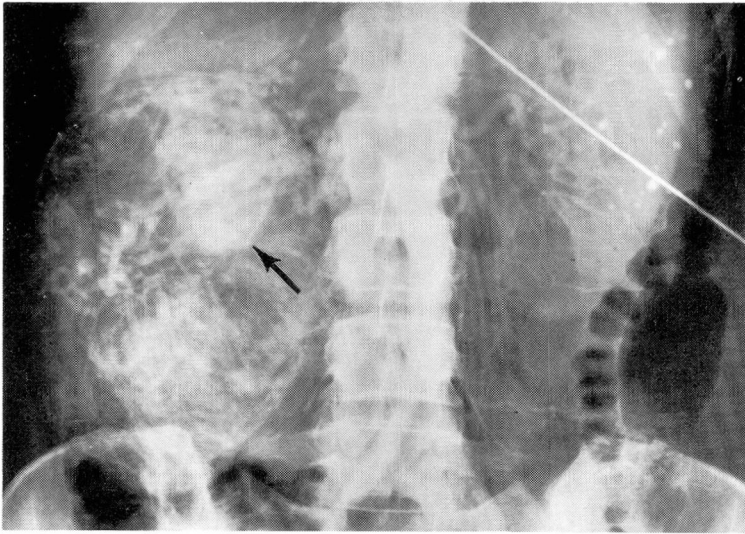
Fig. 2. Renal angiogram showing evidence of numerous dilated vessels traversing the large renal mass, and a large pool of contrast medium (arrow) representing an arteriovenous fistula.

divided, the neoplastic mass suddenly enlarged, indicating the presence of collateral circulation. The tumor was quickly removed intact and all bleeding was controlled. The patient required a transfusion of three units of whole blood to maintain a steady blood pressure during the operative procedure.