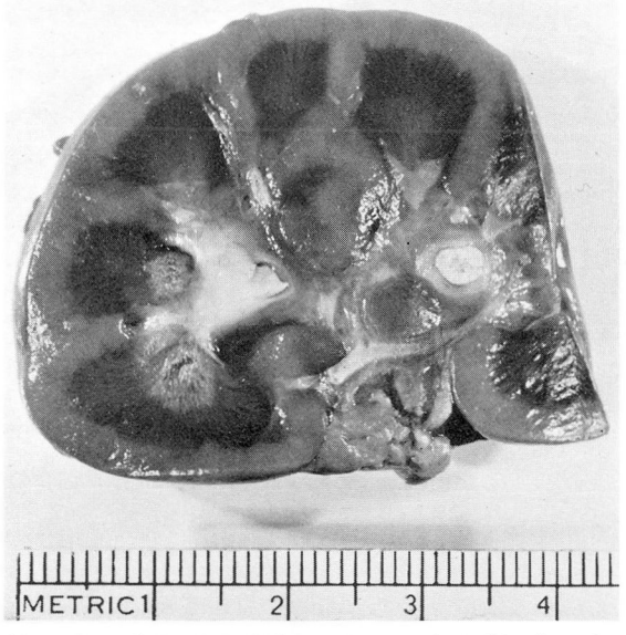
Fig. 1. Longitudinal section of the right kidney, showing bilirubin deposits at the tips of the renal papillae.

form is a function of the liver. Integral to the conjugating system is the enzyme, glucuronyl transferase. As shown by Schmid, Hammaker, and Axelrod, this