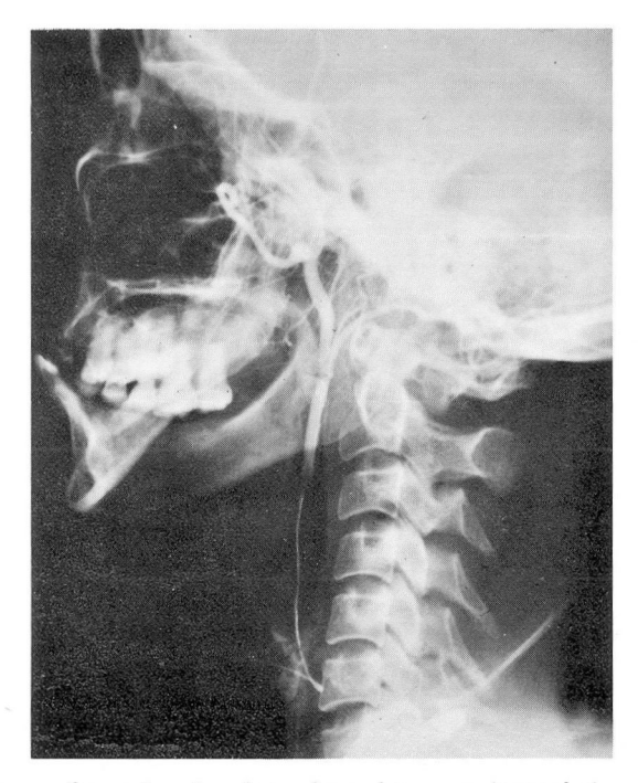
Fig. 1. Arteriogram of a patient in whom the catheter was inserted through the common carotid artery. The tumor was in the pharynx, in the region supplied by the internal maxillary artery.

in centimeters can be calculated by multiplying the mean arterial pressure in millimeters by 1.36 (the specific gravity of mercury is 13.55). For the average patient with a blood pressure of 150/90 mm. of Hg, the bottle of fluid must be approximately 180 cm. above the level of the artery that is being infused. With the aid of a Hi-lo bed, or by placing the patient on a mattress on the floor, patients with a systolic pressure of 200 mm. of Hg or more can be infused by gravity alone. A one-way flow valve is inserted into the hub of the arterial cannula. This prevents hemorrhage if the tubing should come apart.