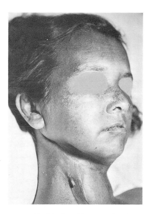
Fig. 2. Same patient as Figure 1. The injection of fluorescein into the catheter outlines the area into which the chemotherapeutic agent will be infused. Photographed under a Wood's light.

muscularly every 6 hours. The white blood cell count is determined daily, and is used as a guide to drug dosage; oral and intestinal ulcerations have not been a useful parameter of dosage. Treatment is continued until the white blood cell count decreases to approximately 3,500 per milliliter for patients with a normal, pretreatment white blood cell count. For those patients with a pretreatment leukocytosis, treatment is stopped when a significant decrease in the white blood cell count occurs. The decrease in white blood cells is usually not associated with a decrease in the red blood cell count. An antibiotic is given until the white blood cell count returns to normal. The infusion is repeated one week after the white blood cell count returns to normal. Additional infusions depend upon the clinical responses to the first two. Patients who have shown a favorable response are maintained on from 5 to 10 mg. of Methotrexate orally for four days each week indefinitely. A white blood cell count is obtained weekly and is used as a guide to therapy.