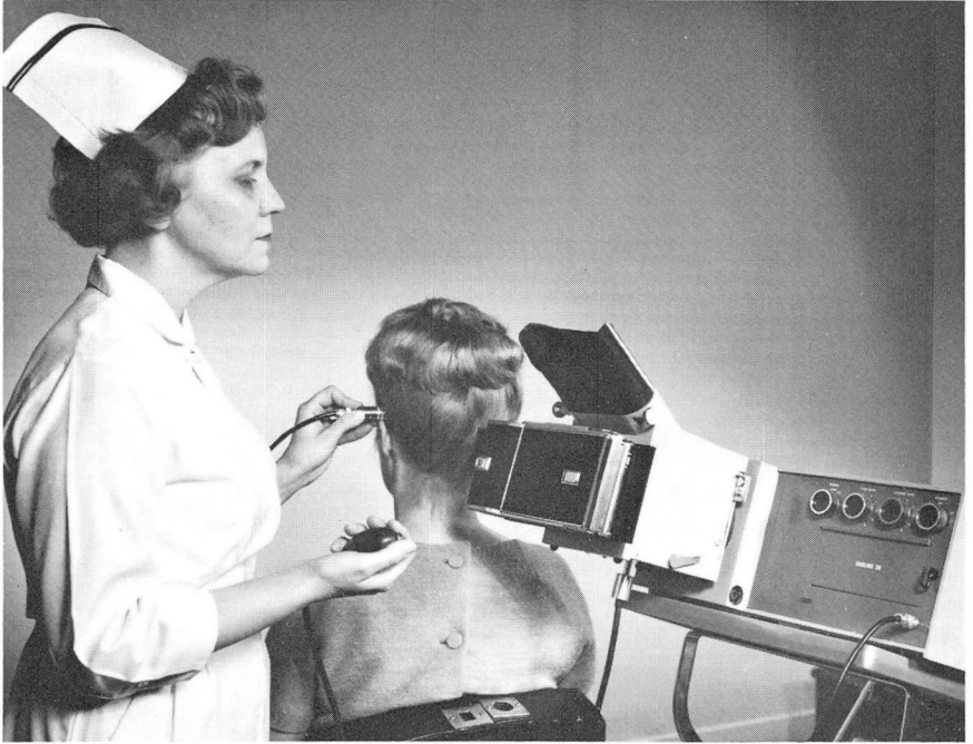
Fig. 1. Photograph showing the application of the transceiver probe of the Ekoline 20 unit to the skin over the ear, and the camera unit that photographs the oscilloscope tracing.

tion of a head injury. Two months previously he had had muffled hearing and tinnitus; examination by a specialist revealed fluid behind the ear drum.