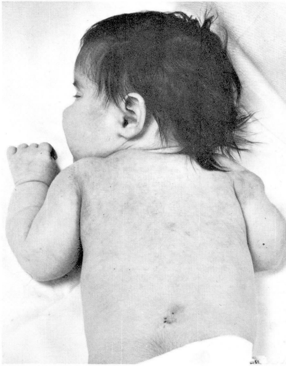
Fig. 1. Photograph taken on the second hospital day, demonstrating the elevated, firm, nodular, subcutaneous lesions on the back.

started. The serum calcium level decreased to 13.1 mg. per 100 ml. on the fourteenth hospital day, and to 11.2 mg. three days later. Only at that time did the urine specimen register a negative Sulkowich test; previously, repeated tests on urine specimens taken just before feeding were 3 or 4+. The mother's serum calcium content was 9.6 mg. per 100 ml., and serum phosphorus, 2.2 mg. per 100 ml.