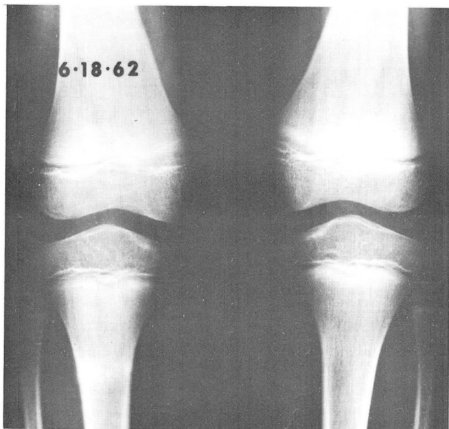
Fig. 3. Case 2. Roentgenogram taken on June 18, 1962, showing stress fracture of the right tibia.

The laboratory tests were all within normal limits. Roentgenograms of the legs revealed evidence of a stress fracture of the right upper tibia ( Fig. 3 ).