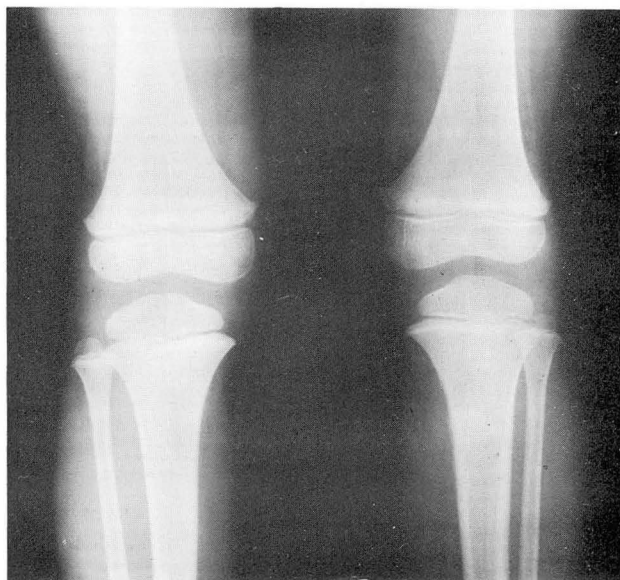
Fig. 1. Case 1. Roentgenogram taken on May 31, 1962, showing stress fracture of the left tibia.