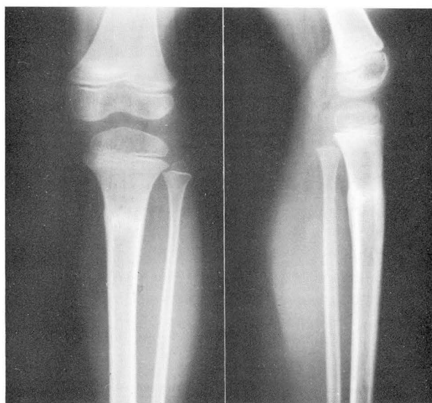
Fig. 2. Case 1. Progress roentgenogram taken on July 3, 1962, showing the healed fracture.