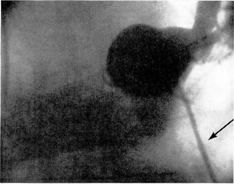
Fig. 1. Pulmonary arteriogram, frontal projection. The catheter was placed in the main pulmonary artery, its shaft is lying in the right ventricular outflow tract (arrow). The left lower pulmonary artery has been completely obstructed (right lower corner).

Blood pressures were quickly measured in the main pulmonary artery, the right ventricle, and the right atrium. The main pulmonary artery was selectively opacified with 40 ml of contrast medium (90% Hypaque sodium) injected under pressure, and was photographed in the frontal projection. After this injection the patient became intensely cyanotic; dyspnea was severe, accompanied by coughing; levarterenol bitartrate was administered and his condition improved. Television fluoroscopic monitoring of the pulmonary arteriogram suggested multiple bilateral pulmonary emboli and, pending review of the film, the patient was transferred to the operating room.