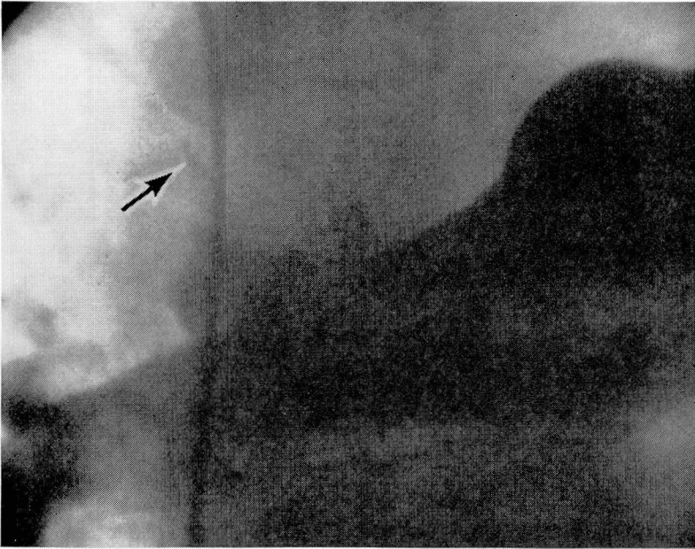
Fig. 2. Pulmonary arteriogram, frontal projection, showing the right main pulmonary artery and its primary bifurcation. The artery to the right upper lobe of the lung is completely obstructed (arrow).

was started, and the mean blood pressure was kept at about 50 mm Hg. Approximately nine minutes passed, from skin incision to partial bypass. Another venous line was then inserted in the inferior vena cava through the right atrium, and an excellent venous return was obtained. Umbilical tape was placed around the pulmonary artery, and a clamp was applied to the proximal main pulmonary artery. A transverse incision gave excellent exposure. A ring forceps was used to remove a large thrombus from the left upper lobe—one branch went down to the lingula, and another completely occluded the right upper lobe; the right lower lobe was free of thrombus. With a long rubber catheter and increased suction, we were once more able to explore the major division of the pulmonary artery, and small pieces of clot were removed ( Fig. 5 ). The heart was beating during the entire procedure and the clamp on the pulmonary artery was released intermittently to prevent heart dilatation.