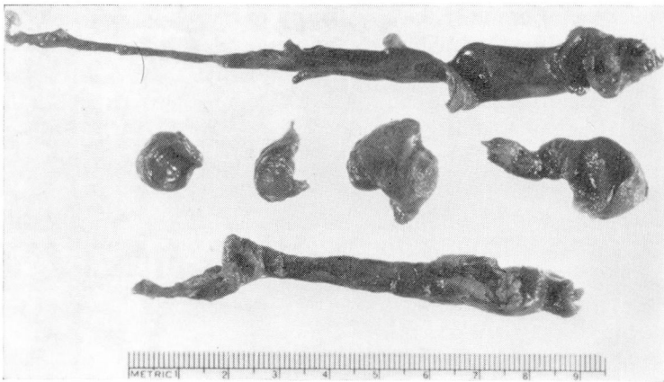
Fig. 5. Photograph of pulmonary embolus fragments removed at operation.

sion. There is disagreement among clinicians concerning the mechanical versus the reflex factors in the underlying basis for the pathophysiology. Sabiston and Wagner, 11 and Gorham 12, 13 favor the mechanical concept as the primary factor. The available data suggest that arterial supply of at