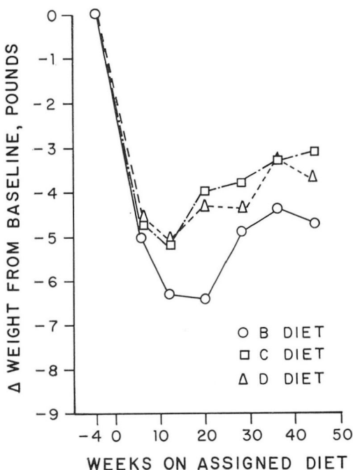
Fig. 1. Graph showing changes in weight during the first year in urban centers. (From National Diet-Heart Study Research Group: The National Diet-Heart Study final report, Circulation (suppl. I) 37: I-1 - I-428, March 1968; and by permission of the American Heart Association, Inc.)

Various factors other than diet are known to affect serum cholesterol levels. Of these, the season of the year had little if any influence. The base line serum cholesterol level influenced the extent of reduction; those levels higher than 240 mg per 100 ml, decreased from 20 to 32 mg more than did those with base line levels less than 210 mg. As is well known, weight loss in itself causes a decrease in serum cholesterol content. Participants in urban centers lost an average of 6 lb. during the first 12 weeks with the experimental diets; they then regained 2 lb. slowly during the subsequent weeks (Fig. 1). This weight loss was reflected in the decrease in serum cholesterol content in free-living participants, with all diets, during the first few weeks of the experimental period (Fig. 2). The difference in serum cholesterol