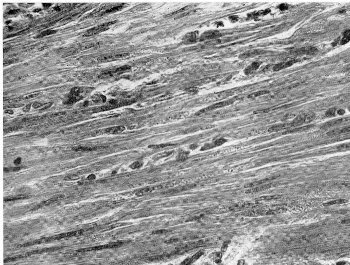
Fig. 3. Photomicrograph of a section of the muscularis propria of the ileum, depicting the presence of granules in the smooth muscle cells. Note the paranuclear location of the ceroid granules. Hematoxylin-eosin-methylene blue stain; magnification \times 380 .