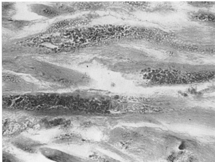
Fig. 4. Photomicrograph of a section of the muscularis propria shown in Figure 3 . Hematoxylin-eosin-methylene blue stain; magnification \times 900 .

tion and a defect in lipid formation leading to an accumulation of various lipid products. Some support to this view is obtained from the electron microscopic studies of affected smooth muscle (from a patient other than the one's whose case we report). The intracellular cytoplasmic granules, from 1000 Å to from 1 to 2 \mu in cross diameter, distorted small Golgi complexes, mitochondria, and bundles of myofilaments. The granules were osmiophilic, varied in size, and some possessed a single-unit limiting membrane ( Fig. 4 ).*