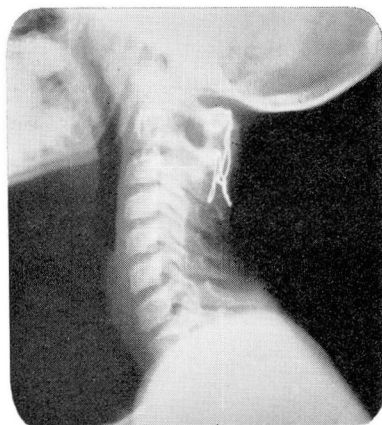
Fig. 3. Roentgenogram of lateral cervical spine showing solid spinal fusion extending from the first to the third cervical vertebrae with posterior bone graft and wire fixation.

spinous process space between the first and second cervical vertebrae was increased. The dura between the first and second cervical vertebrae was transparently thin.