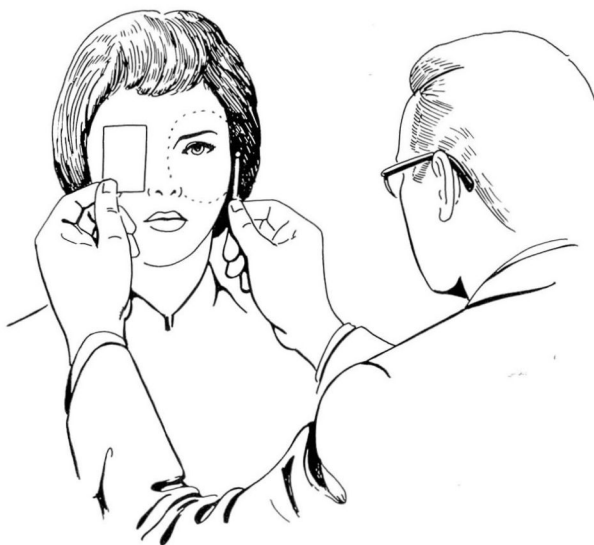
Fig. 3. Sketch showing the Kestenbaum 2 outline perimetry test. The tip of a stick is moved into the field of vision from different directions and over various facial prominences. Kestenbaum found that visual fields generally conform to these facial boundaries.

Kestenbaum allowed for a quantitative measurement, but a simple fast, and nearly exact result is obtained by moving a finger or pencil into the