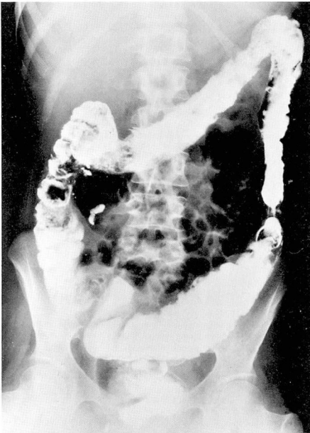
Fig. 1. Roentgenogram of the colon after barium enema, March 1965. Loss of haustral markings; ulceration; asymmetrical but diffuse involvement characteristic of transmural (Crohn's) colitis. Note "whiskering" ulceration of transverse colon and narrow distal descending colon.

Meanwhile, diarrhea had increased with no evidence of rectal bleeding; she had crampy abdominal pain and had lost weight. Multiple oral aphthous ulcerations, a distended and tender abdomen, and perianal tenderness and swelling were found on examination. A proctosigmoidoscopic examination was normal. Barium enema, normal in 1964, now showed evidence of Crohn's disease of descending and transverse colon with nodular, distorted mucosal pattern ( Fig. 1 ). Barium was seen in the vagina, but a definite