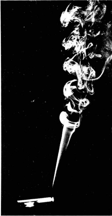
Fig. 1. The difference between laminar and turbulent flows can be seen by watching the smoke rising from a cigarette in a still room.

flow. After the smoke has risen a certain height above the ember, the layer-like or laminar flow becomes unstable and there are obvious velocity components perpendicular to the main direction of flow. This later flow is turbulent.